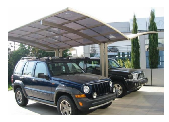
Double-Sided Cantilever Carport